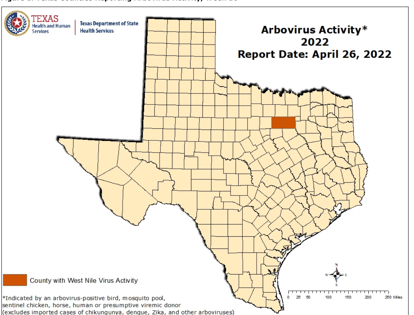
Figure 1. Texas Counties Reporting Arbovirus Activity, Week 16