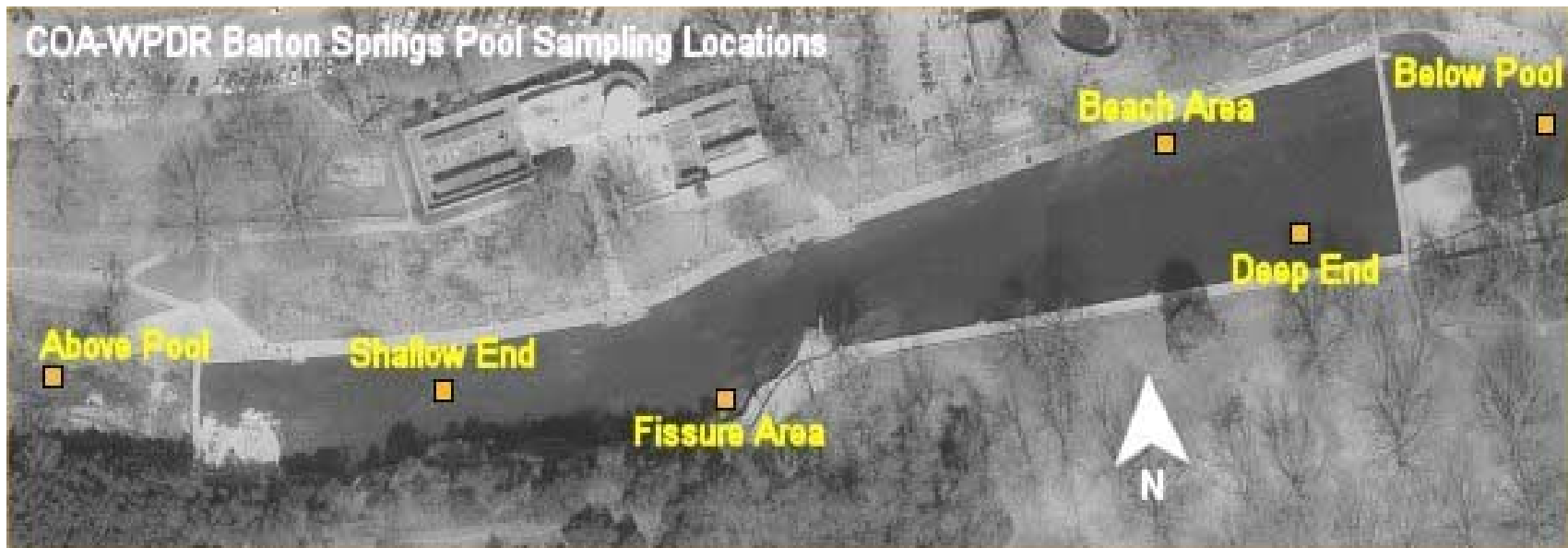
Figure 1. Barton Springs Pool