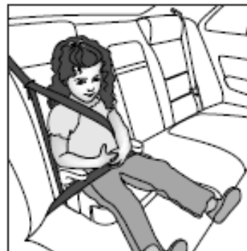
Backless booster seat: belt positioning strap with child