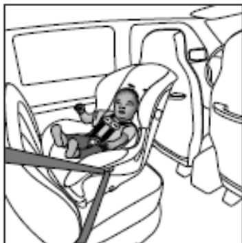
Rear facing convertible seat: installed with child