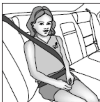
Correct restraint: 11-year-old