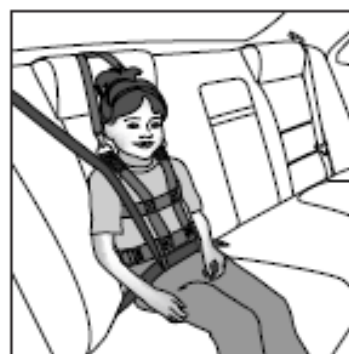
Vest type restraint: installed with child