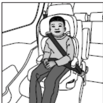
High back booster seat with child