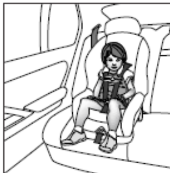
Forward facing convertible seat: installed with child (LATCH)