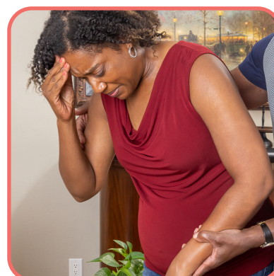
Dizziness or Fainting