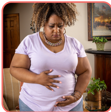
Baby's Movement Stopping or Slowing During Pregnancy