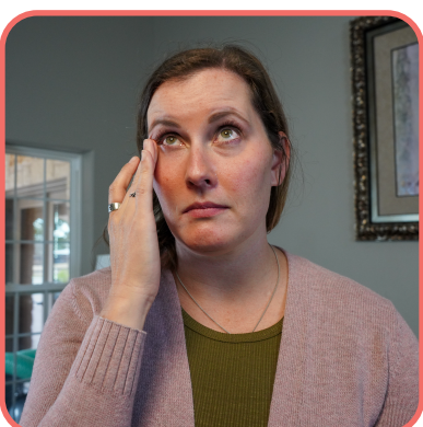
Changes in Your Vision