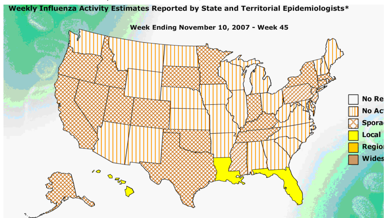
Texas Department of State Health Services, Infectious Disease Control Unit > Surveillance

For more information on flu surveillance activities in the State of Texas, please visit our main surveillance page.