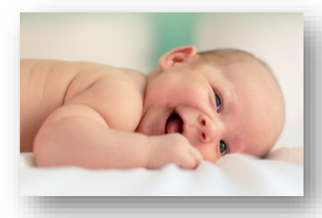
Spina bifida and encephalocele are neural tube defects usually apparent at birth.