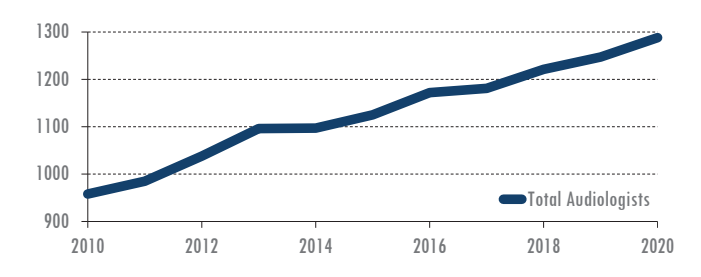
Figure 1. Total Audiologists