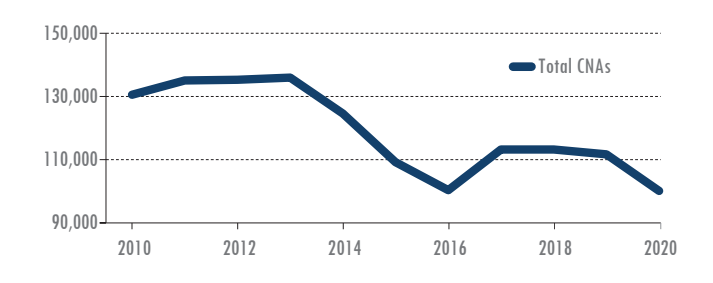
Figure 1. Total CNAs