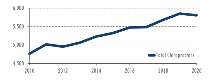
Figure 1. Total Chiropractors