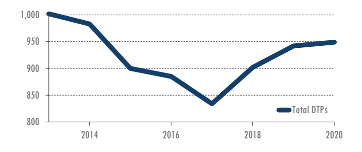
Figure 1. Total DTPs