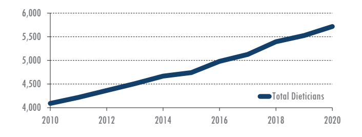
Figure 1. Total Dieticians