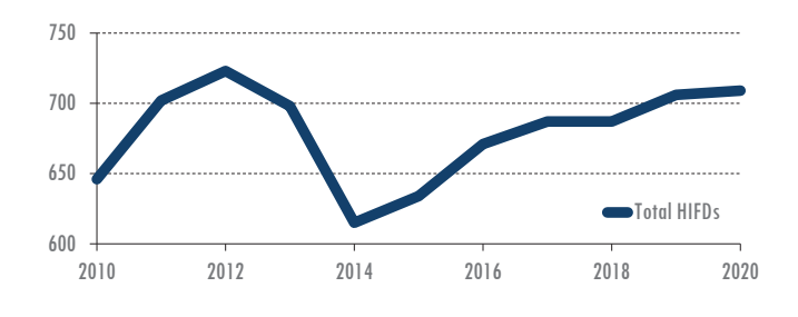
Figure 1. Total HIFDs