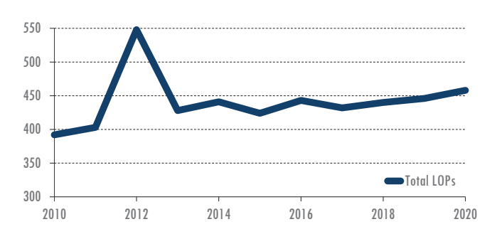
Figure 1. Total LOPs