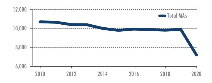
Figure 1. Total MAs