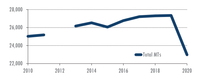
Figure 1. Total MTs1