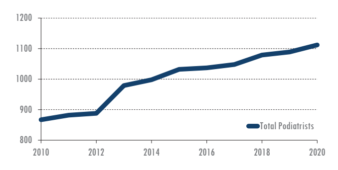
Figure 1. Total Podiatrists