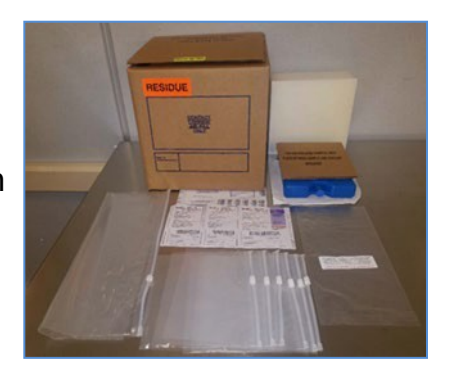
Figure 2: Residue