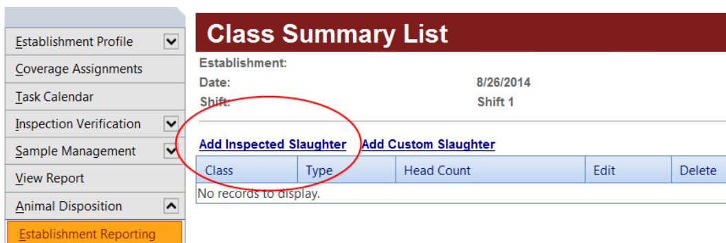
Figure 2 - Adding Inspected Slaughter

B. NVSL will report histopathology results by telephone, fax, e-mail, or regular mail to the appropriate in-plant IIC within 24-48 hours after receiving the sample. The CV may call NVSL if no results are made available after 72 hrs. The CV is to base the carcass disposition on histopathology findings and his or her observations.